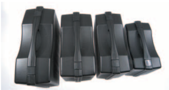
T 2055 B T 2037 BXL T 2037 B T 2026 B

▲ For the heavy employment are these double walled TEKNO-blow moulded cases the right decision.