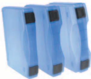
T 2003 S T 2003 M T 2003

▲ TEKNO cases are mostly sold in the colour combination silver-grey with blue locks.